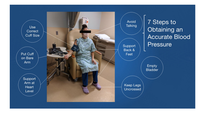
Figure 2. Steps for obtaining an accurate blood pressure assessment