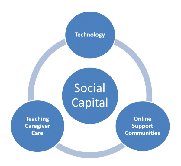
Figure 1. Social Capital as a Concept to link key Components of the Study

Social capital was used as the concept for linking technology, online support communities, patient-centered care and care of the caregiver (see Figure 1).