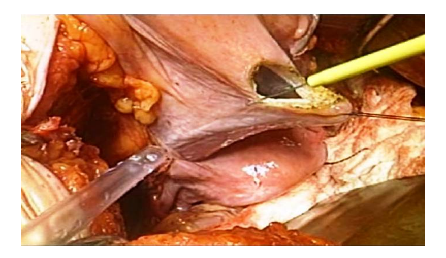
Figure 1. Creation of initial of cystostomy

From January 2001 until October 2010, Twelve patients (n=12) were diagnosed with primary UA of the urinary bladder on initial cystoscopy and transurethral resection biopsies. All patients underwent CT and MRI staging followed by case discussion at our centers uro-oncology multi-disciplinary meeting (MDT) meeting.