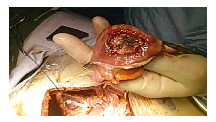
Figure 3. Excised Urachal adenocarcinomas