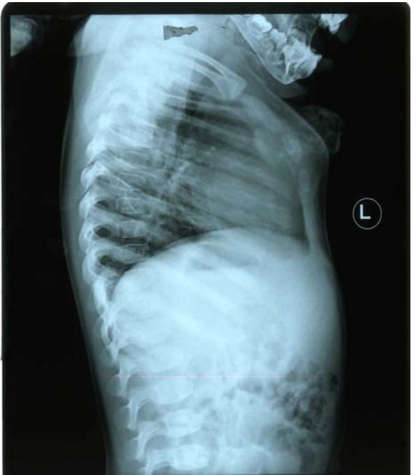
Figure 2. Chest X-Ray showing multiple ribs cortical destruction