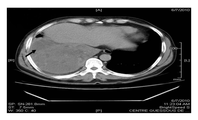
Figure 2. CT image showing a right basal mass with liquefied tissular density that enhances after injection

The patient underwent a right lower lobectomy extended to the diaphragm with phrenoplasty. Pathological examination of the surgical specimen has shown a malignant tumor proliferation, sometimes arranged in long beams crossed at right angles sometimes in diffuse sheets, with fusiform tumor cells with enlarged, irregular and hyperchromatic nuclei and clear or eosinophilic cytoplasm.