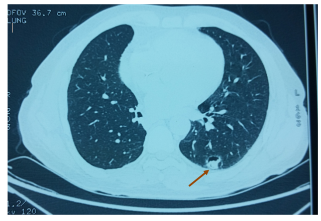
Figure 5. CT image: a caviarty lesion which became irregular and nodular (arrow)

After 18 months, thoraco-abdomino-pelvic and brain CT control showed an increase in the volume of the left lower lobar lesion, of which the wall became irregular and the appearance of a nodular lesion in this cavity (see Figure 5). The PET scan confirmed the hyper-metabolic nature of the lesion. In multidisciplinary meeting the decision was to perform surgical exploration. The patient benefited a left lower lobectomy (after trans-parietal biopsy in favor of a lung metastasis of the leiomyosarcoma).