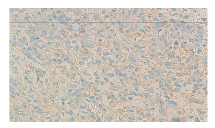
Figure 3. Positive immunostaining (cytoplasmic) of tumor cells by antibodies AML (smooth muscle actin): Sarcomatous spindle cell proliferation with positive immunogold antimuscle smooth antibodies

Immunohistochemistry (IHC) staining was performed. The tumor cells were positive for AML(anti smooth muscle actin), Hcal desmone, actin, S100 protein, Epithelial membrane antigen (EMA) and Melan A was positive, which was in favor of pleural leiomyosarcoma grade II of the FNCLCC (see Figures 3 and 4). After discussion in a multidisciplinary meeting, adjuvant chemotherapy was started with IA protocole: Ifosfamide + Adriamycin, the patient received four chemotherapy cycles. The clinical and radiological control of 3, 6 and 12 months didn't reveal any tumoral progression.