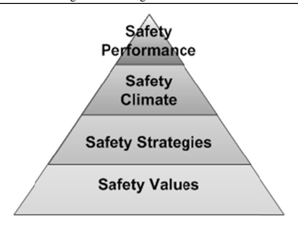
Figure 1. Safety Culture Pyramid

Each level of the Safety Culture Pyramid contributes to the overall safety culture within an organization; consequently, each level should be examined and evaluated to determine its contribution and to identify systemic problems as well as opportunities for improvement. This article focuses on the influence of trust and job satisfaction on safety climate.