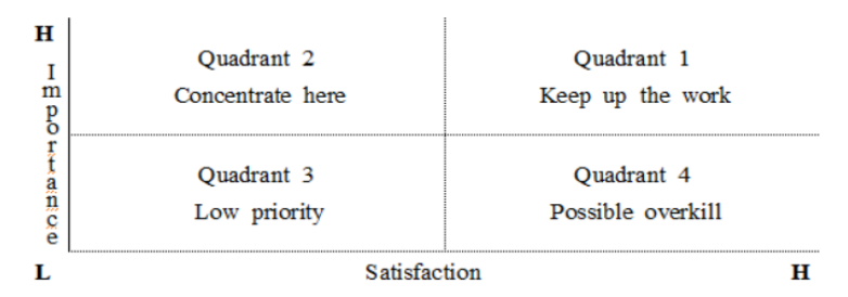
Figure 1. IPA Matrix

IPA indicates location of attributes on four quadrants divided based on the center while representing importance on the vertical axis and achievement on the horizontal axis as two dimensional drawing. Quadrant 1 is for 'keep up the work,' quadrant 2 is for 'concentrate here,' quadrant 3 is for 'low priority,' and quadrant 4 is for 'possible overkill' as shown in the [Figure 1]. This matrix provides useful information to determine what needs to be solved in priority with pre-determined manpower and budget, and items belonging to quadrant 4 are of priority for the improvement (Zhang and Chow, 2004).