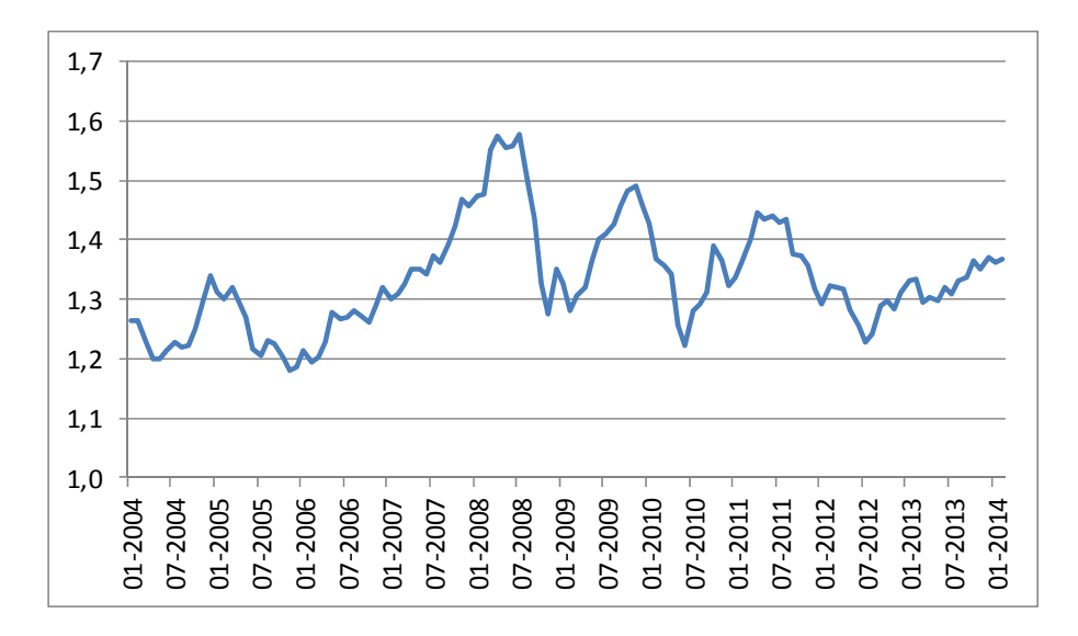
Figure 1. USD/EUR exchange rate, nominal since 2004

The main purpose of the paper is (a) to discuss the challenges for ECB monetary policy stemming from the sharp rise of the euro in the context of a nascent euro area recovery and (b) to assess the Euro exchange rate impact of the envisaged Quantitative Easing (QE) in this respect.