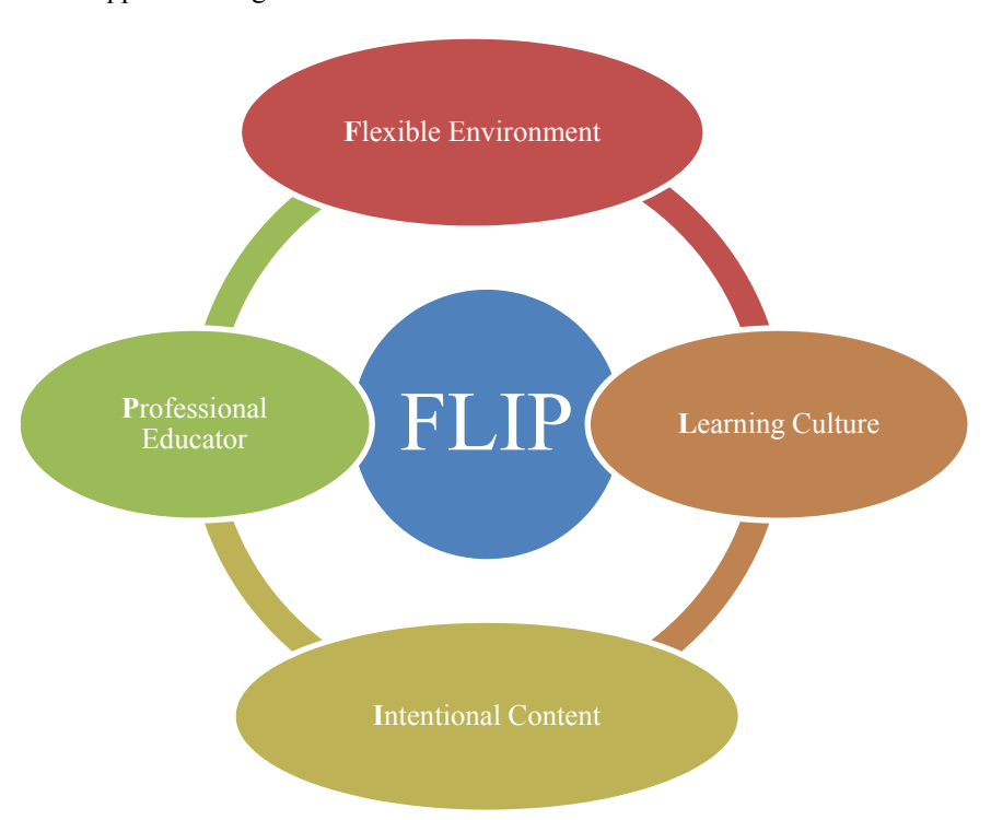
Figure 1. The Four Pillars of the Flipped Learning (FLN, 2014)

By FLN (2014) standards, for a class to be considered "flipped" it must have four basic pillars (Figure 1): (1) a flexible environment in which students choose when and where they learn, (2) a learning culture where student-centered model is applied, (3) an intentional content used by educators to maximize classroom time in order to adopt methods of student-centered, active learning strategies, depending on grade level and subject matter and (4) a professional educator who takes on less visibly prominent roles in a flipped classroom and remains as the essential ingredient that enables flipped learning to occur.