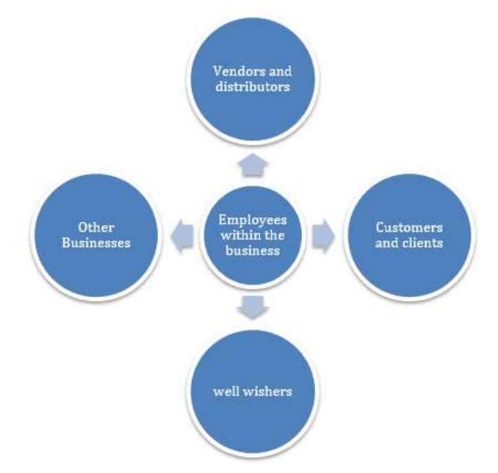
Figure 1. This will represent the communication skill that helps in business