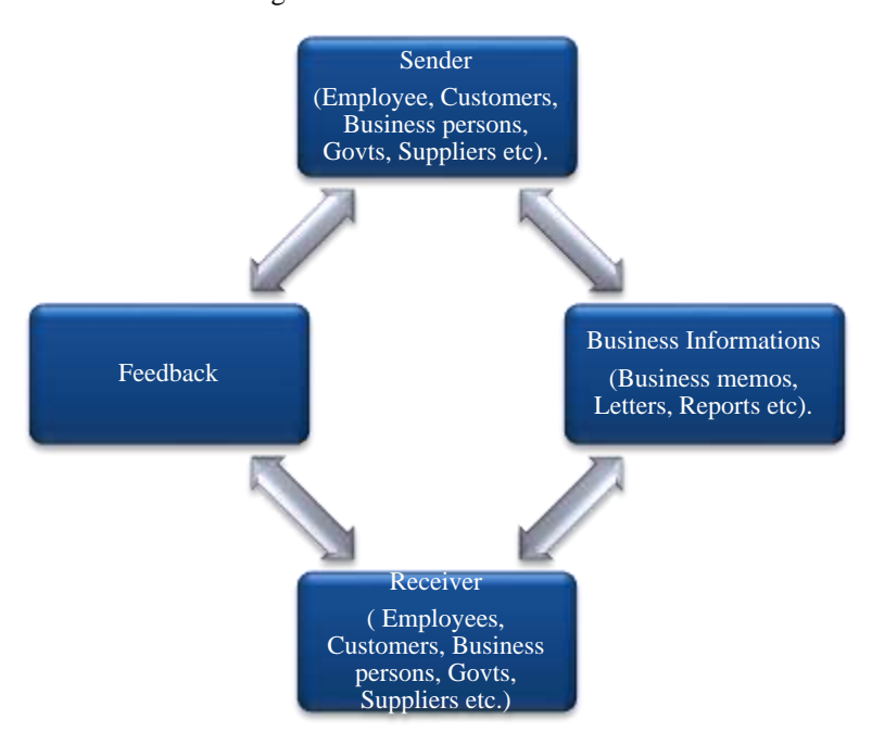
Figure 1. Shows the key elements of Business communication

The capacity to communicate effectively is crucial to every company's success. The practice of transmitting message from one source to another, both within and without the corporate environment, is referred to as business communications. The term business communications is derived from general communication which is related to business. B usiness communication, in other terms, means communication among business parties or persons for the purpose of fulfilling business-related tasks (V. Sharma and K. K. Gola 2016). Without feedback, business communication is incomplete. Organizations of days are fairly large and employ a large number of people. There are various levels of hierarchy in a firm. More the levels there are in an organisation, more the challenging it is to operate it. Communication is crucial in the procedures of directing and controlling the organization's workforce. It's feasible to get rapid response and, if required, eliminate miscommunications. Effective communication among superiors and followers, and among the firm and society in general, is critical in every organization (M. R. Sharp and E. R. Brumberger 2013). Business communication includes four basic elements such as Sender, Information, Receiver as well as Feedback as shown in Figure 1.