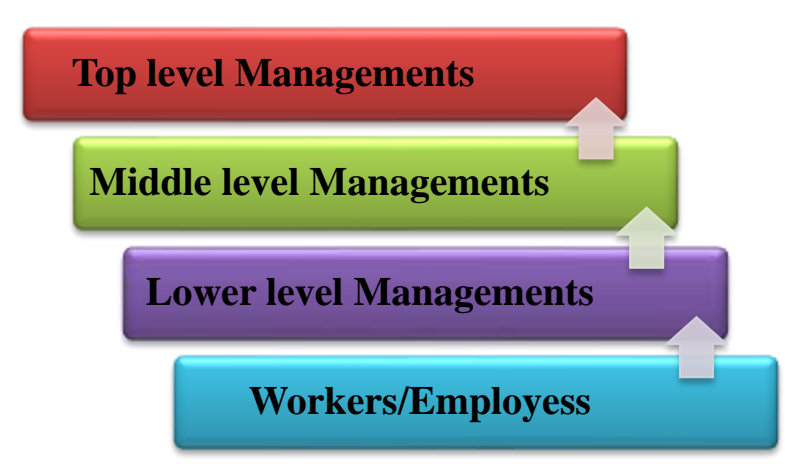
Figure 4. shows the Business communication from the bottom to Top

This type of internal communications employs the bottom-to-top management techniques. Information's is sent down the hierarchy between workers to administrators and anybody upward in. As indicated in Figure 4, workers/employees in an institution's HR departments, for example, create an attrition reports and transmit it to the HR Manager. The attrition report details an organization's monthly or annual turnover of employees, as well as the factors that contribute to it. This aids the HR Manager in discovering the core cause of employee turnover and implementing prompt corrective action to reduce turnovers.